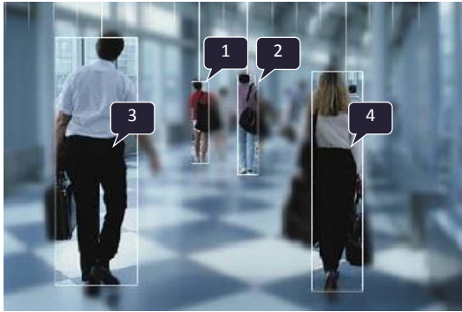
People COUNT software

Airports, bus and train stations, bars and clubs, car parks, retails stores and shopping malls, museums and tourist attractions, sports stadia and leisure facilities - just some of the environments where video analytics can offer a cost effective, robust and highly accurate solution.