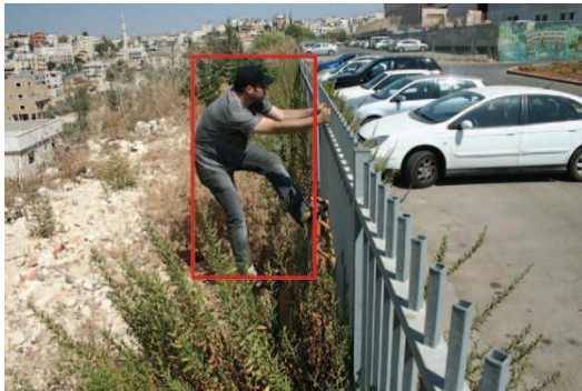
Video Content Analytics

Automatic number plate recognition for 4 channels, incl. Engine, Black- & White list management application. Partno: 0063-99987