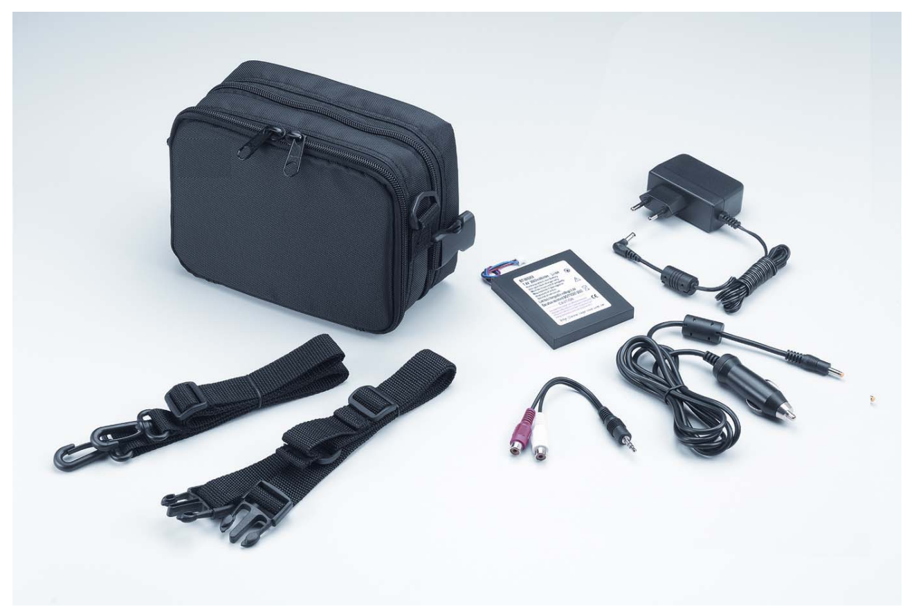
Accessories included with the LV56